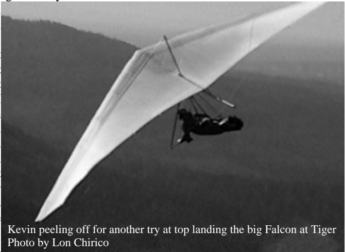
Kevin peeling off for another try at top landing the big Falcon at Tiger