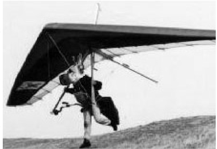
What's wrong with this picture? Ans. No helmet.